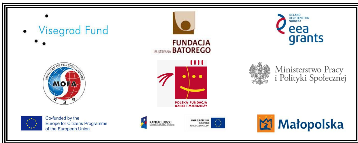
Figure 2. the key funding providers for the VUF

Our major achievements include publishing of a report about watchdog civil society organization (SCOs) from Poland and Europe 1 , extensive networking with other European CSOs, and establishment of an informal network of CSOs from Poland and Georgia. Just recently, we have set up the Association of Balkan Development in Serbia.